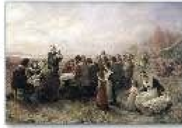
A painting of the Pilgrims and the Native Americans at the first Thanksgiving.

The local Native Americans were members of the Wampanoag tribe. The tribe gave the Pilgrims food. One of the tribe members was Squanto, who taught the Pilgrims to grow corn and catch fish.