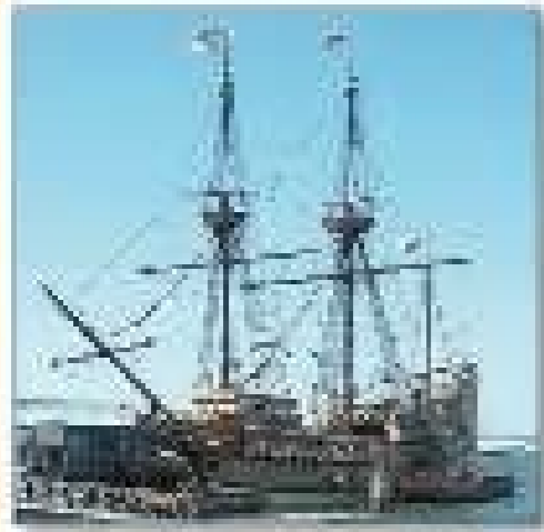
A modern copy of the Mayflower , the ship that brought the Pilgrims to America